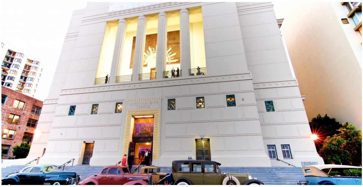
VALLEY OF OAKLAND, CA